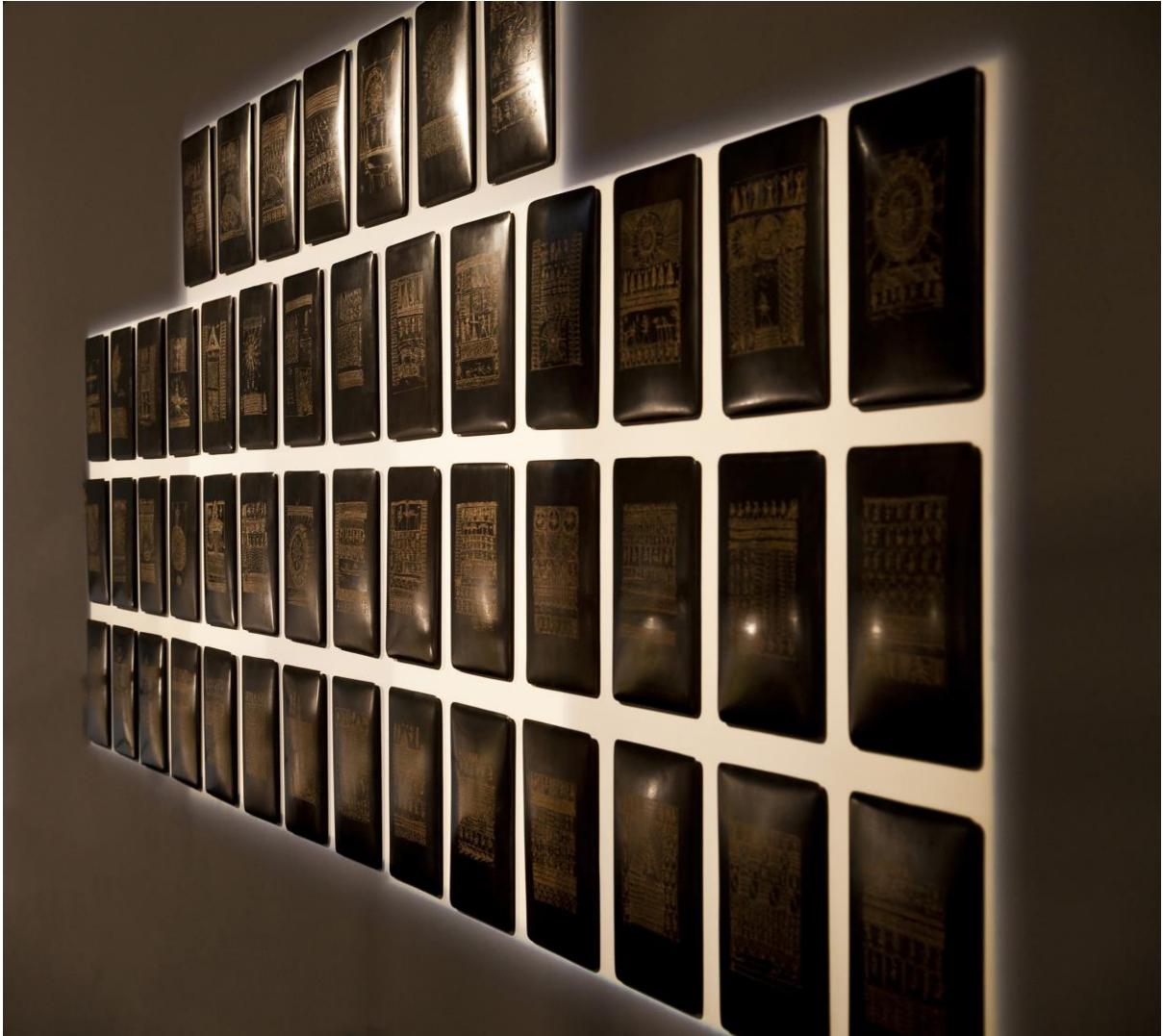
Talisman , 2015, Installation view, selection of 99 black patina bronze engraved tablets, H. 35 x W. 22 cm each