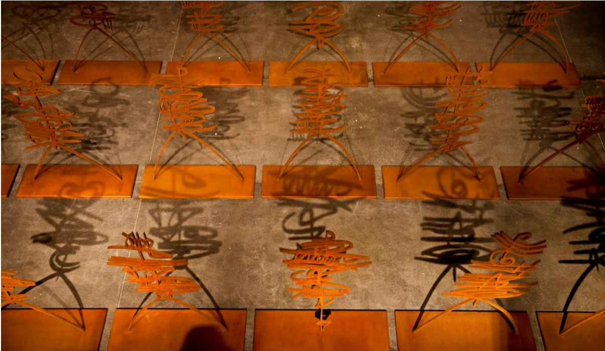
Exhibition views of Les Priants , Elmarsa Gallery

In an ode to Elmarsa Gallery's longstanding collaboration with Rachid Koraïchi, we would like to present an exhibition that revisits a collection of his work. On view from the 27 th of February until the 25 th of May, 2024, the exhibition will encompass a breadth of disciplines that Koraïchi has enmeshed into his practice, highlighting his abiding fascination with the creation of deeply layered seams. Showcasing the iconic site-specific installation comprising of Les Prieurs alongside Les Priants , the two towering polished bronze and green patina sculptures and a selection of the twenty-one unique Corten steel sculptures will fill the space, casting delicate and shifting shadows. Accompanying the sculptures will be a body of two-dimensional work ranging in medium and highlighting Koraïchi's ability to insight a moment of reflection to the onlooker. Draped along the lengths of the gallery's three-meter walls will be the encased silk organza tapestries, embroidered with glyphs that are brought together to encapsulate the timeless themes of the changing seasons.