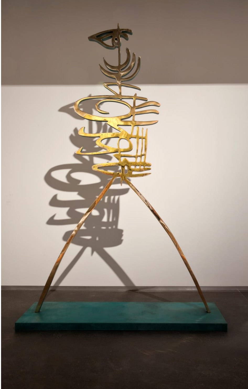
Les Prieurs II , 2015, Polished bronze and green patina, H.280 x L.130 x W.7cm