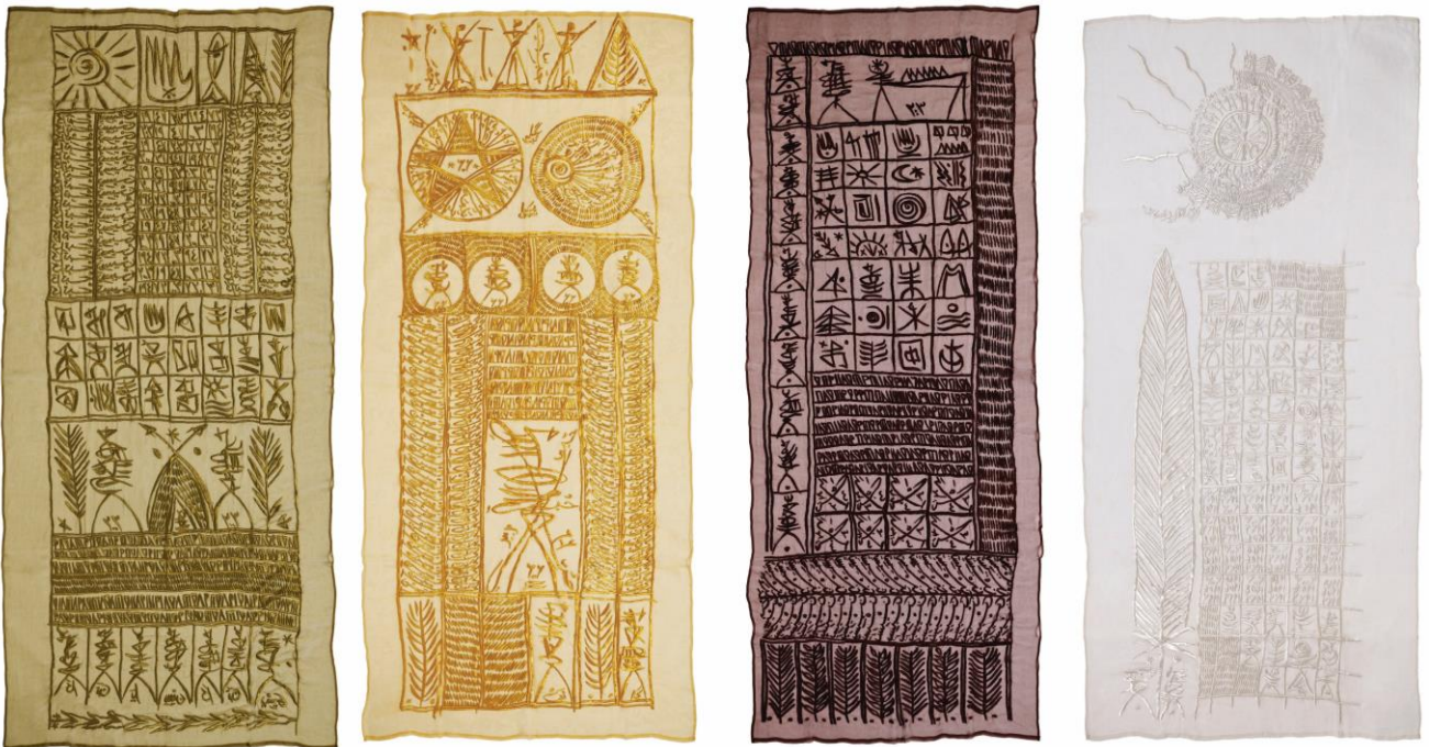
Nedjma - The Four Seasons , 2009, Silk embroidered organza, plexiglas, 304 x 152 x 7 cm each