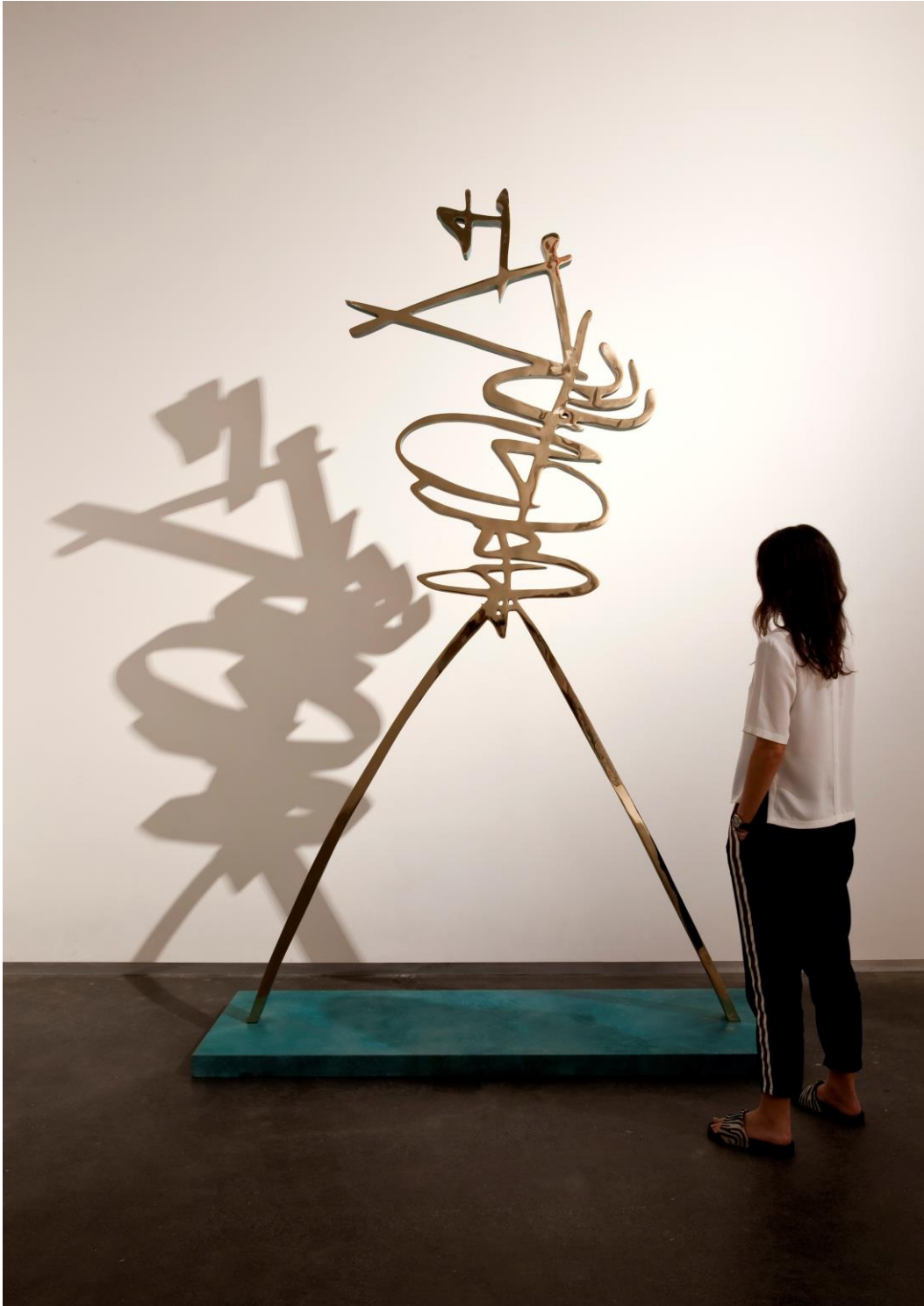
Les Prieurs III , 2015, Polished bronze and green patina, H.280 x L.130 x W.7cm