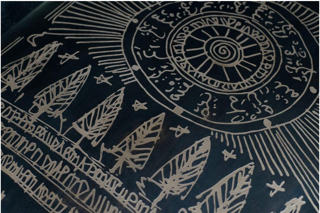
Detail views of Talisman , 2015